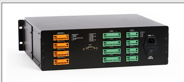
Rear panel input/output connections

The Control Unit in the multi-channel format can also include a moisture in liquid analysis or oxygen measurement function by combining with the Liquidew I.S. Moisture in Liquid Analyzer or the Minox-i O 2 transmitter.*