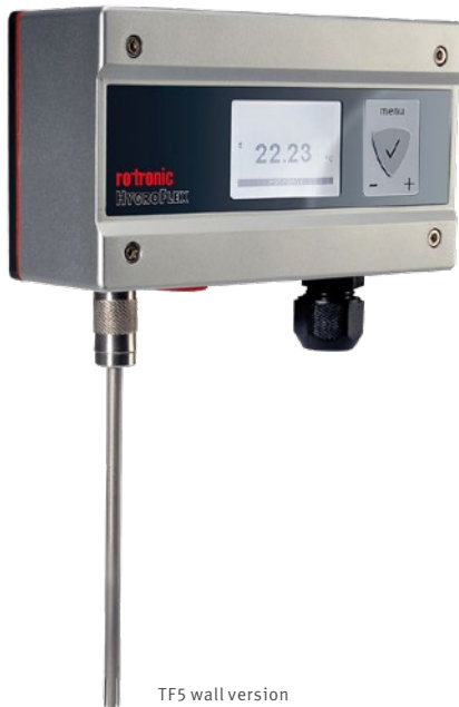
TF5 wall version